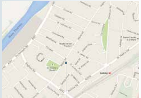
St Andrew's Church

The church is highly accessible, close to Surbiton railway station and bus routes (71, 281, 465, K1, K2, K3, K4), and with good provision for eating and drinking close by. In addition to on-street parking, there are car parks nearby at Waitrose, Sainsbury's, and St Philip's Road.